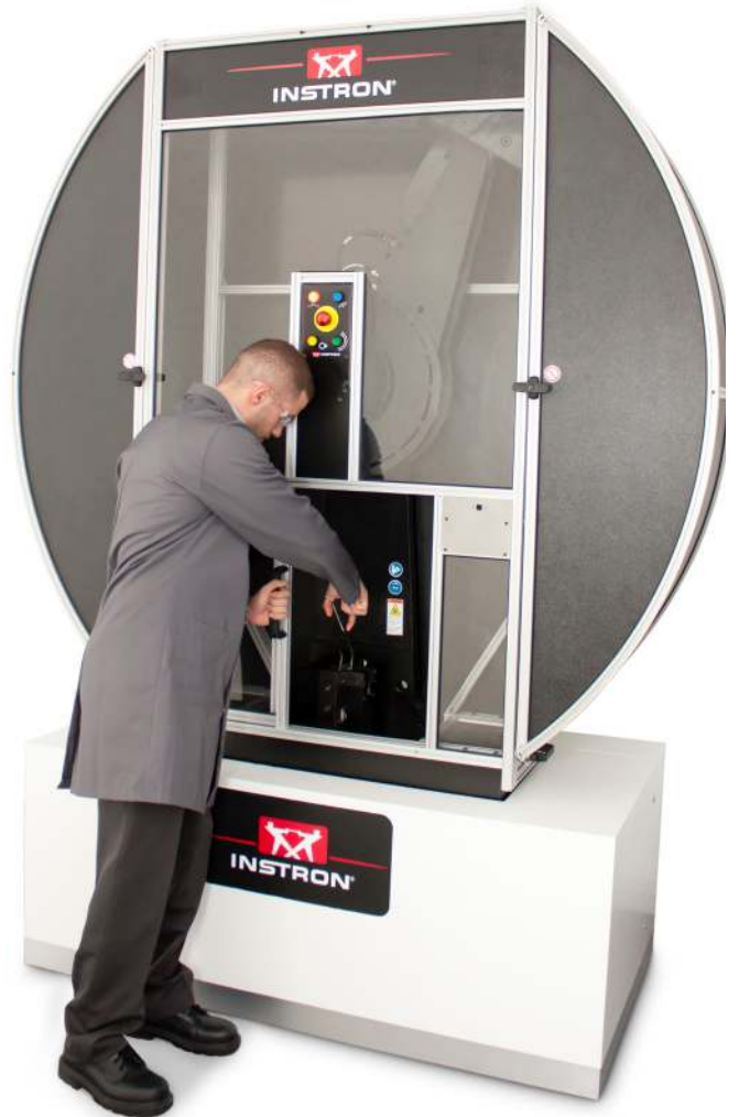
450MPX Impact System