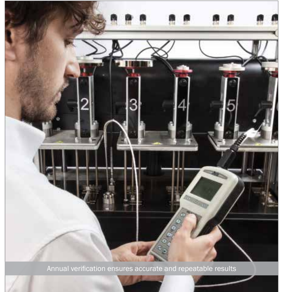
Annual verification ensures accurate and repeatable results

Factory trained engineers provide comprehensive verifications, checking the dimensions of critical components and temperature behavior, to assure results are accurate and repeatable. The verification certificates provide full traceability, providing confidence in the laboratory's results.