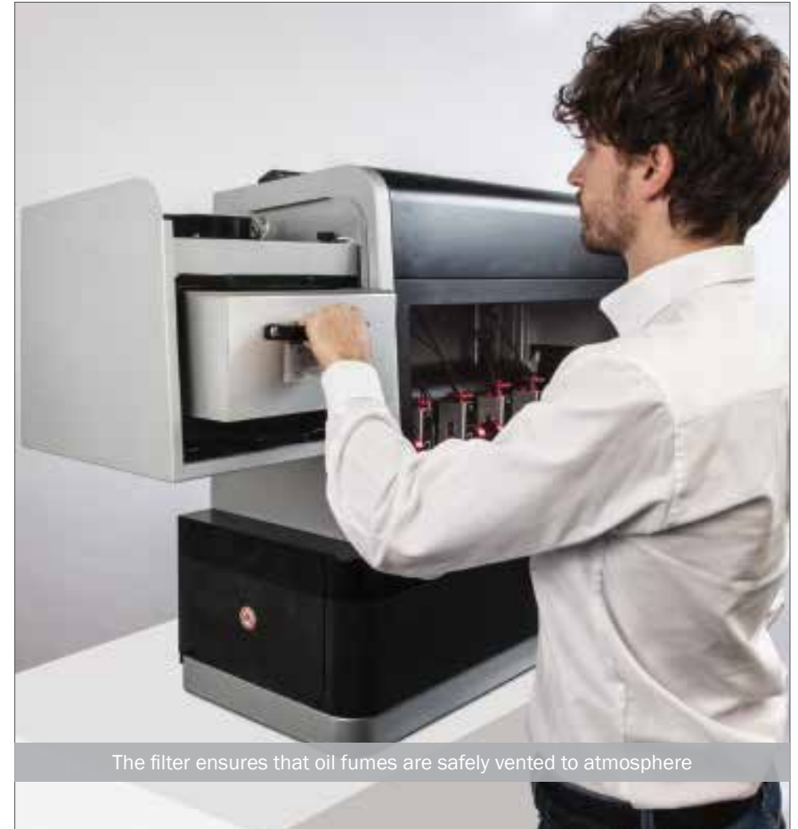
The filter ensures that oil fumes are safely vented to atmosphere

Instron engineers offer comprehensive on-site training courses to minimize operators' exposure to risk, improve efficiency, optimize the system's capabilities and to support the laboratory's health and safety policies to enhance the ownership experience.