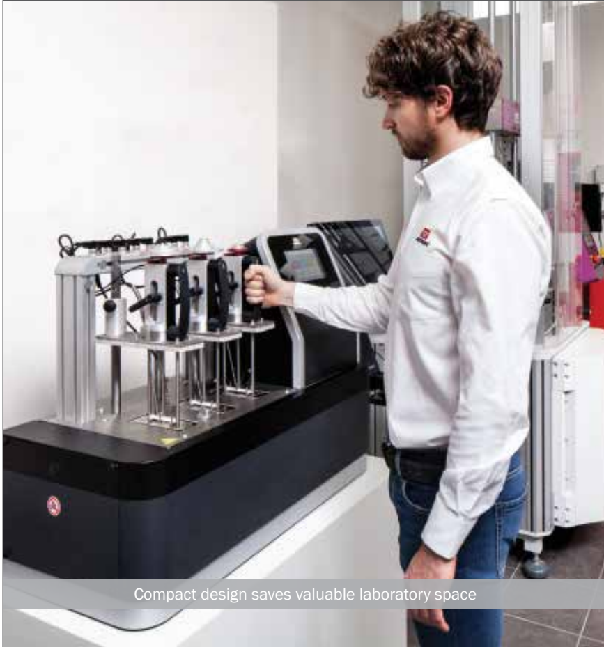
Compact design saves valuable laboratory space

Integrated Innovations for Efficient Tests